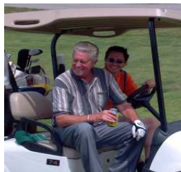
Sharing golf stories and fellowship @ West Chase

Lunch, fellowship and putting preceded the 1:30 PM shot-gun-start with dinner & awards ceremony following the outing.