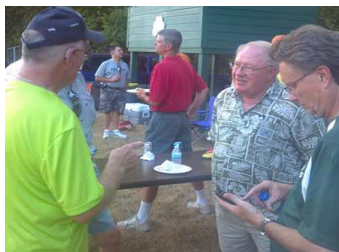
Council #12540 members share stories during the "Knight Nite" cookout

Come join our next "Knight Nite" on August 20th for food and fellowship!